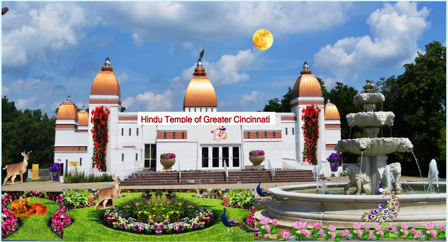
Hindu Temple of Greater Cincinnati

Directions to the Hindu Temple From I-275 take Exit 63A (32West) - Stay on left at the exit- turn right onto OLD 74 -take first right- after 1/4th mile turn left at the first Traffic light onto Summerside Road. After approximately one mile turn right onto Klatte Road and then right on Barg salt Run Road. About a mile or so turn left into temple road. From UC: Take E McMillan to Columbia Pkwy to Beechmont Ave to Route 32 East (to Batavia). Turn left on Old SR -74. Temple phone no.+1 (513) 528-3714.