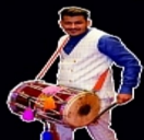
VEER GALA DHOL & DHOLAK PLAYER