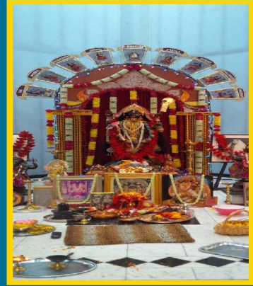
Shree Maa Kali