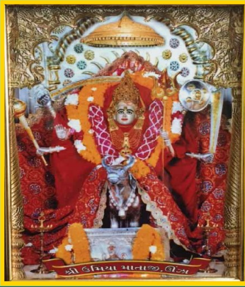
Shree Maa Umiya