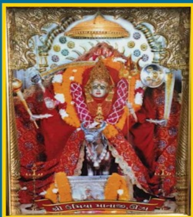
Shree Maa Umiya