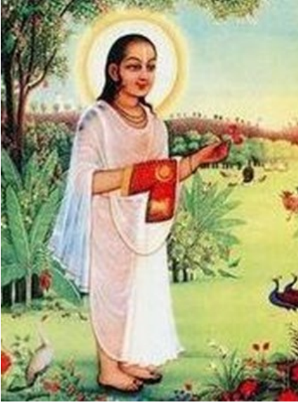
Chaitra/Vaishakhi Krishna Ekadashi (Varuthini 11)-1535vs

Actual day is Chaitra Krishna Ekadashi 1535vs, Varuthini Ekadashi which falls on Monday May 2 nd 2016. Shri Vallabh propagator of Shuddhadwaita (Pure Non-dualism) philosophy, founded at the age of 14 yrs, in 1549vs, founded Pushti Sampraday, the path of Grace and devotion Bhakti of Lord BalaKrishna. Lord Shrinathaji, the Govardhan Leela Swarup (form) of shri Krishna is the Ishtadeva of Pushti Vaishnavas