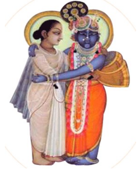
Pratham Milan': 1551vs Shriji and ShriVallabh