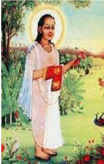
Chaitra/Vaishakh Krishna Ekadashi (Varuthini 11)-1535vs

This year is Shrimad Vallabhacharya's 537 th Jayanti (1535-1587 VS: 1479-1531 CE). Actual day is Chaitra Krishna Ekadashi 1535vs, Varuthini Ekadashi which falls on Monday May 2 nd 2016. Shri Vallabh propagator of Shuddhadwaita (Pure Non-dualism) philosophy, founded at the age of 14 yrs, in 1549vs, founded Pushti Sampraday, the path of Grace and devotion Bhakti of Lord BalaKrishna. Lord Shrinathaji, the Govardhan Leela Swarup (form) of shri Krishna is the Ishtadeva of Pushti Vaishnavas.