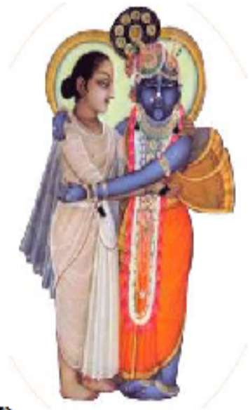
'Pratham Milan': 1551vs Shriji and ShriVallabh