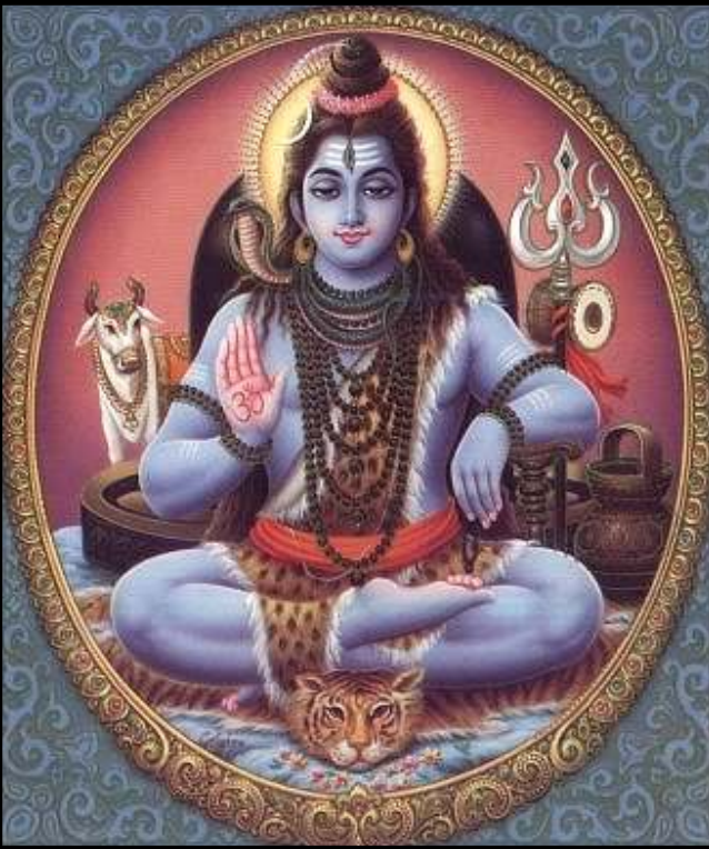
Shiva : Lord of Destruction

Sunder Kand Path is held on 3rd Sunday of the month at 10:30 A.M. In month of Feb. there is a change details inside.