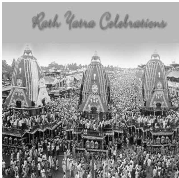
Shri Jagannath ji Rath Yatra Celebration