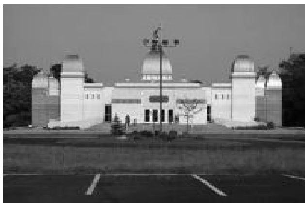
Hindu Temple of Greater Cincinnati

Happy Mahavir Jayanti, Budha Jayanti, and Temple's 9 th Anniversary