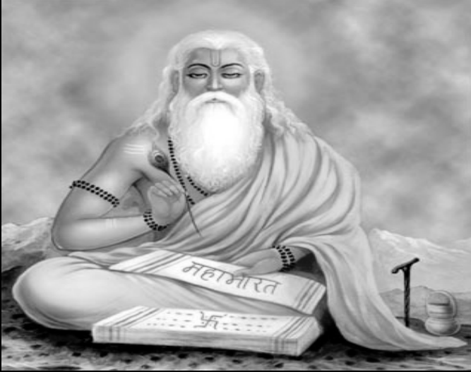
Sage Ved Vyas

The day of full moon, Purnima, in the month of Ashadh is traditionally celebrated as Guru Purnima by Hindus. Also known as Vyas Purnima, the day is celebrated in remembrance and veneration to sage Ved Vyas. He is the Adi (original) Guru of the Hindu Dharma, who classified the Vedas, wrote the eighteen Puranas and the Mahabharat. On this day, the Guru is offered Pujan (worship) by the disciples. First we shall consider the role of a Guru in life.