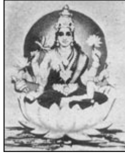
SHRI DHANYA LAXMIJI

Oh! Heroic Mother, Veer Laxmiji! Be merciful to all, as you favored Sheela. Fulfill the desires of all. Bless all with happiness