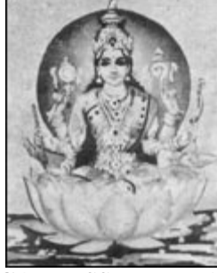
SHRI GODDESS VEER LAXMIJI