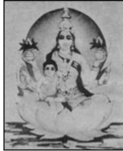
SHRI GODDESS SANTAN LAXMIJI